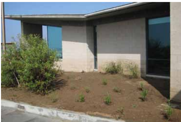
New native California plants at the State Beach Visitor Center.