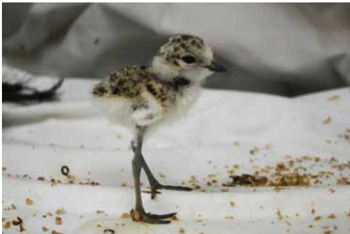
Snowy plover chick hatched at the Huntington Beach Wetlands and Wildlife care center from an abandoned egg.

We hope that birders will report banded Snowy Plovers to 1-800-327-BAND. It will be very interesting and exciting to know how all of these birds fare in the future. It gives validation to the center for our efforts to raise and release healthy birds and to Peter for monitoring and helping to assure that these birds to have a chance to survive.