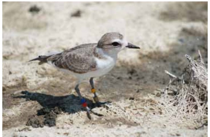
Juvenile snow plover released into wetland August, 2009.